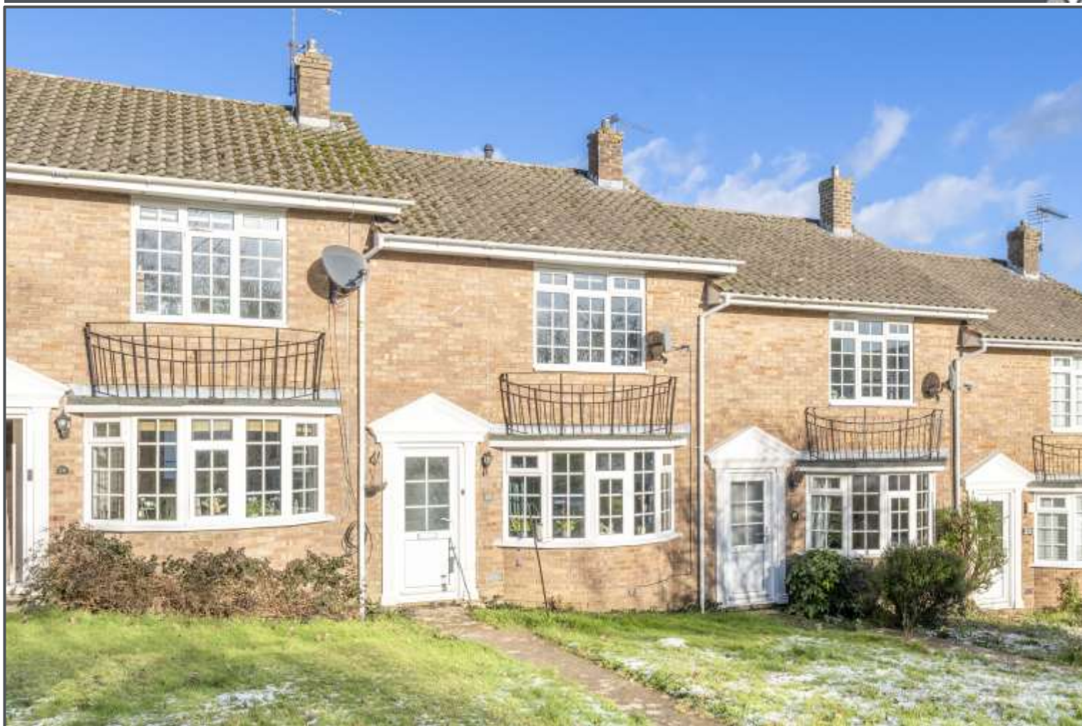
Senlac Green, Uckfield, TN22 1LT